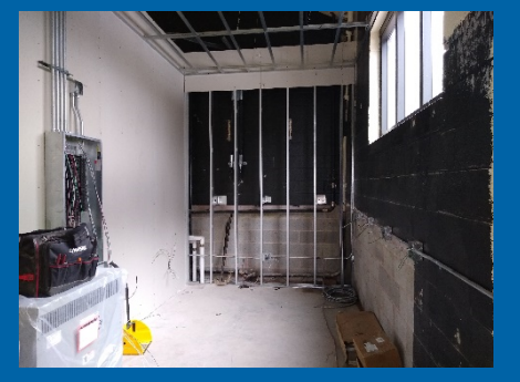
Continue Rough-in at STEM Lab