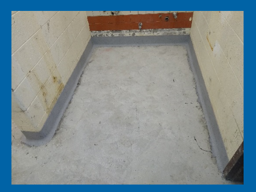
Begin installation of epoxy floor in restrooms at building 2020 and 2021