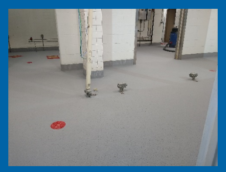
Install Epoxy Floor at Kitchen